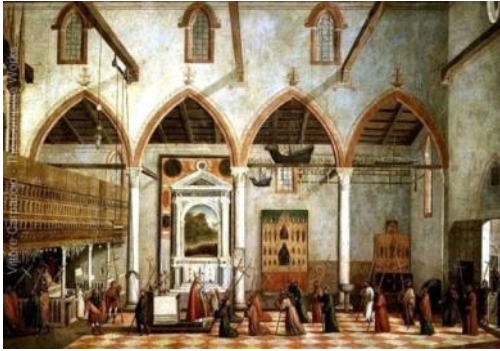
Apparition of the Crucified of Mount Ararat in the Church of Sant' Antonio di Castello, c. 1512.

In the cathedral of Angers (France), for example, towards the evening of Holy Saturday, the enclosure of the high altar was covered above and in front by a great white cloth. It remained covered until the announcement of the Resurrection, which happened not during the Easter Vigil, but rather during Easter Matins. As the clergy approached the altar, they brought two ostrich eggs covered by a silk cloth, and processed to the bishop, the dignitaries, the canons and to all of the choir, singing, 'Alleluia, Christ is risen'.