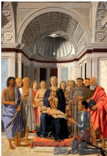
Madonna of the Pala Montefeltro, Piero della Francesca (c. 1472)

'It is in this same way, as is written in the gospel of St Luke, that the Lord looked back at Peter after he had denied Christ. The eggs are thus suspended in churches so that each and every one contemplates that man easily forgets God unless he is illumined by a star, that is, by the influence of the grace of the Holy Spirit, and remembers to return to Him through good works' (Gvillelmi Dvranti Rationale Divinorvm Officiorvm. Corpvs Christianorvm, Continuatio Mediaeualis, vol. CXL (Turnholt: Brepol Editores Pontifici, 1995), 49.