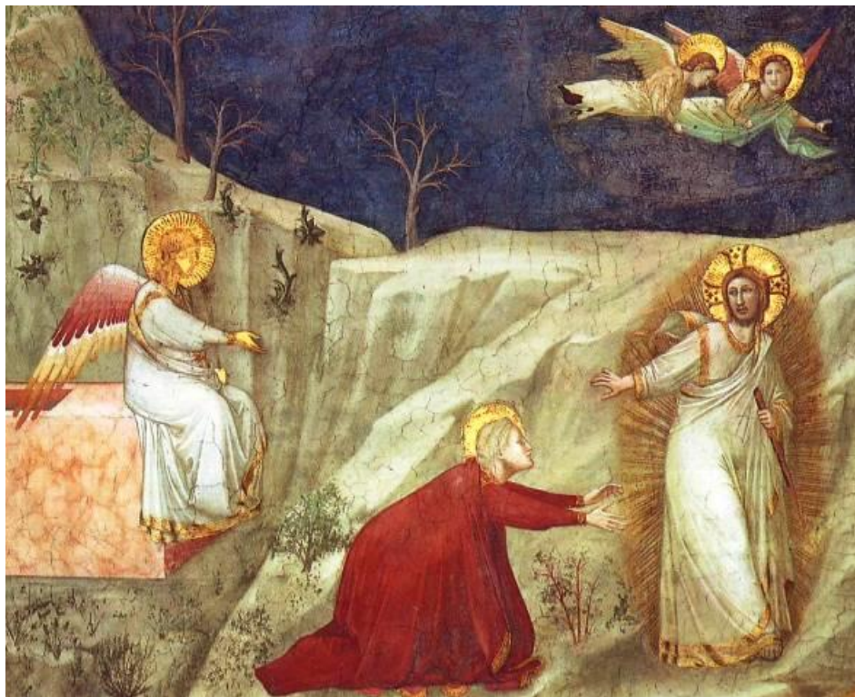
Noli me tangere by Giotto, c. 1304