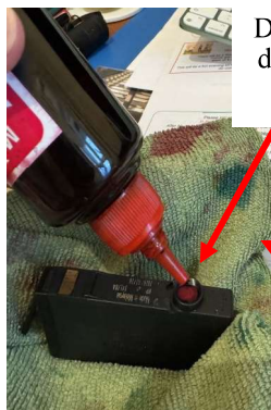
Dripping ink directly into sponge

So that folks, in a nutshell is how I fill my cartridges Fun ay! There are so many other joyous subjects to cover in Nerd corner aren't you lucky?!