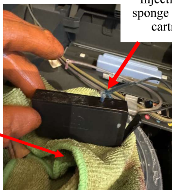
Injecting into sponge in top of cartridge